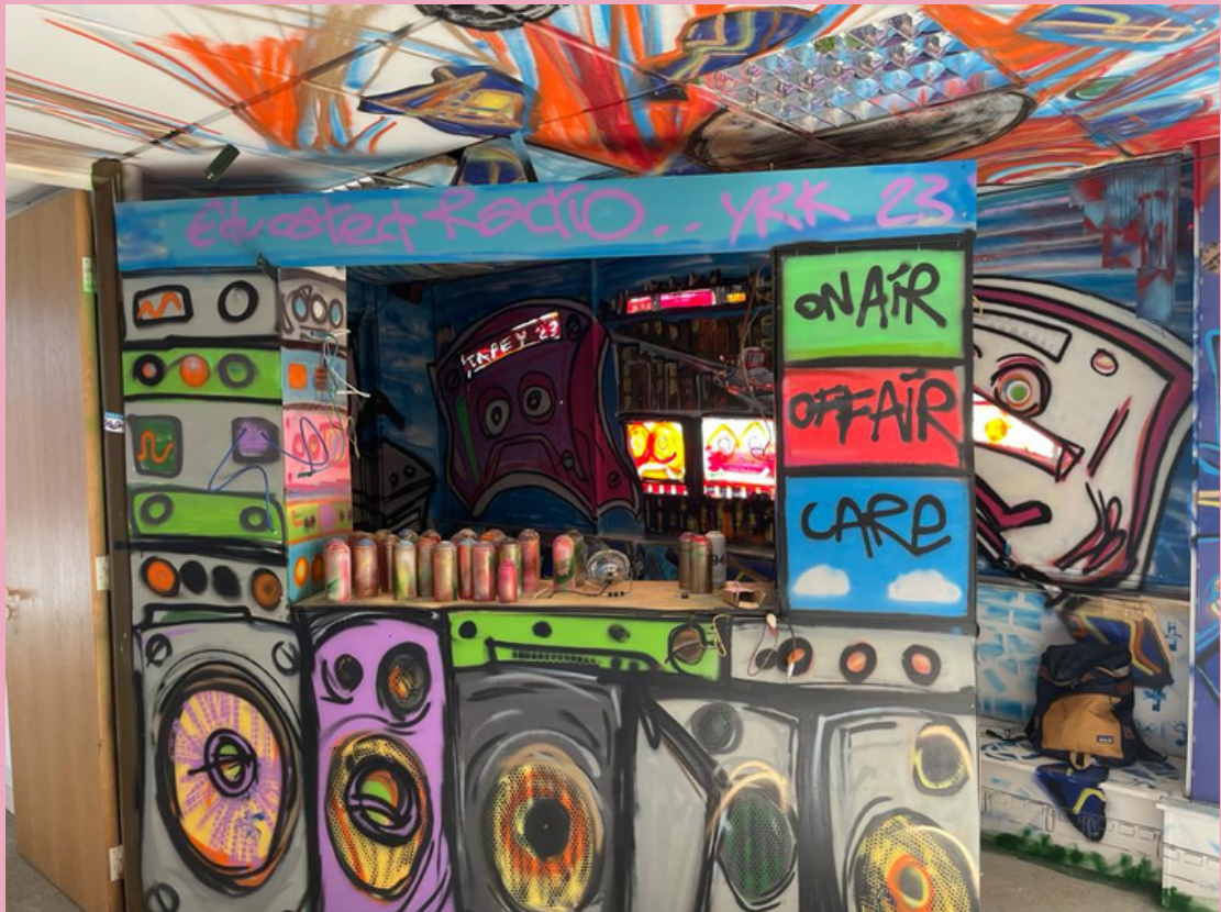
SOLA Artist & Event DJ