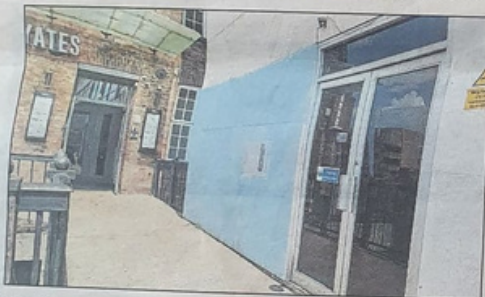
The exhibition is at a building next to Yates.

The event runs for the next two weekends from 10am to 6pm.