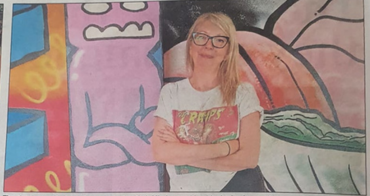
The street art exhibit is raising money for York Mind mental health charity.