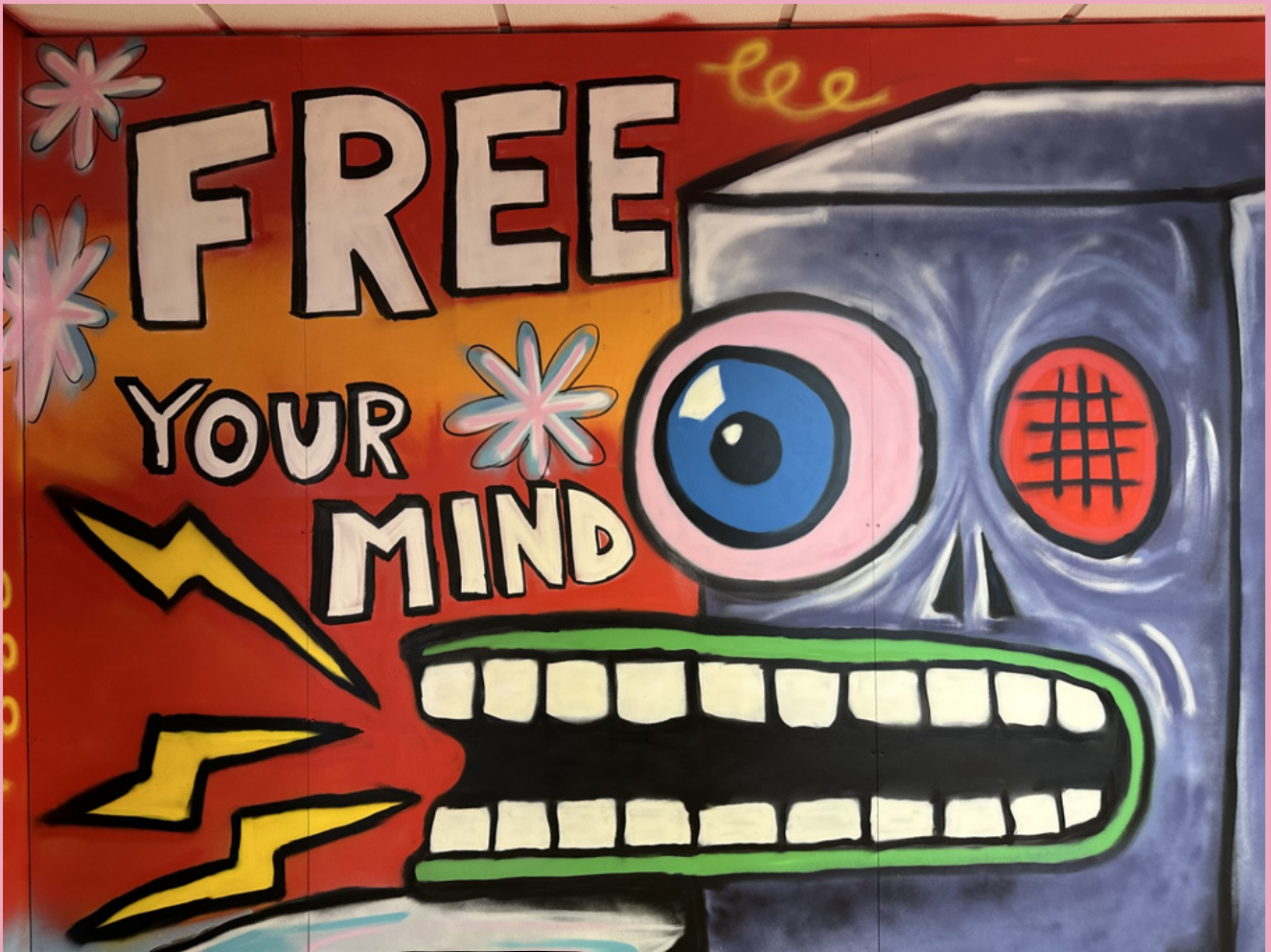
BOXXHEAD - Yerp - MUL