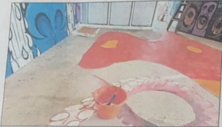
The works are spread across two floors.