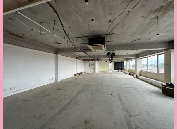
Top Floor after cleaning the place & painting the walls