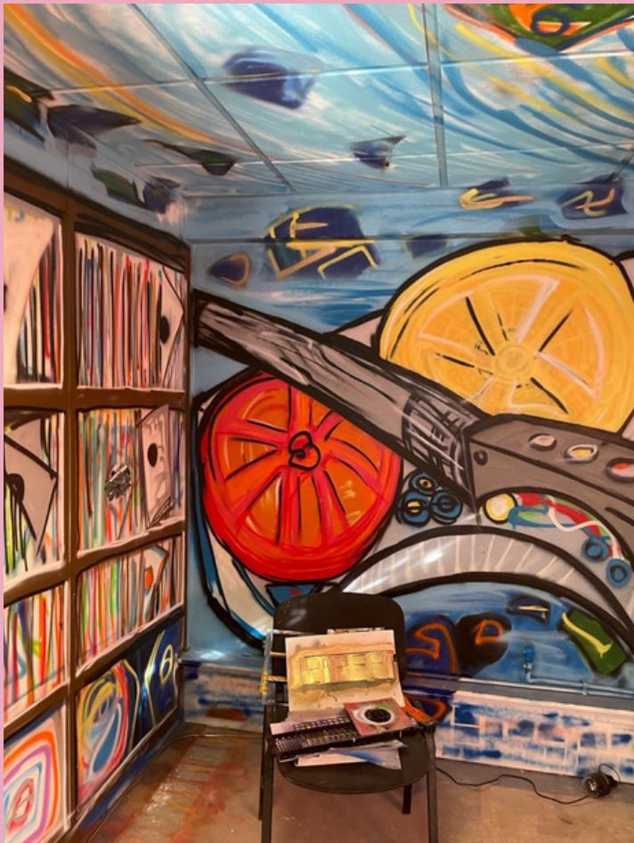
SOLA & Coloquix