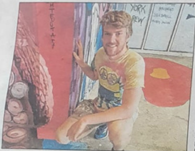
On of the artists at the art exhibition.