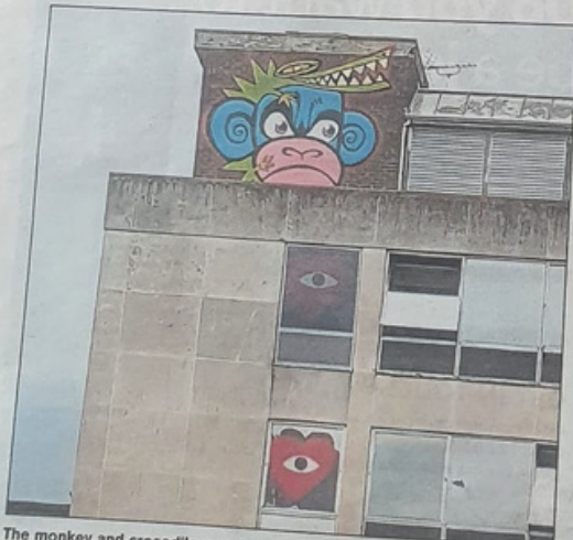
The monkey and crocodile mural at 2 Ousegate.