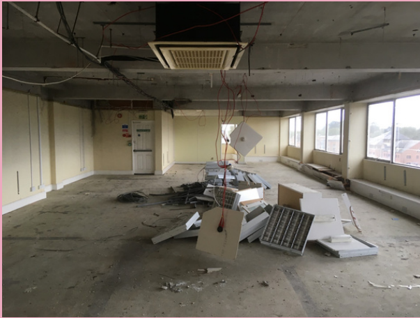
Top Floor before we started

Behind the scenes planning for the event took months. Bombsquad & the York Crew worked together to make the 2 floors habitable. Years worth of dead pigeons, old furniture, a million radiators and rubbish had to be removed. . The owner of the building provided a top team to assist us. A plumber & an electrician also came onboard to get the building usable.