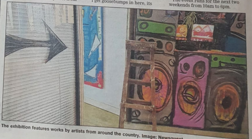
The exhibition features works by artists from around the country.